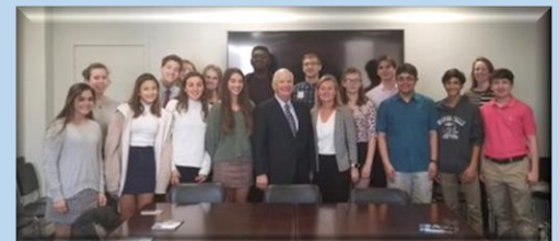
BIL Explorations 1A students tour and meet with Senator Ben Cardin while visiting the U.S. Capital.

BIL Explorations 1A students had the unique opportunity to travel to Washington D.C. to meet Senator Ben Cardin, ranking member of the U.S. Senate Committee on Small Business, and Entrepreneurship. The students were able to discuss with him issues facing young entrepreneurs and business owners.